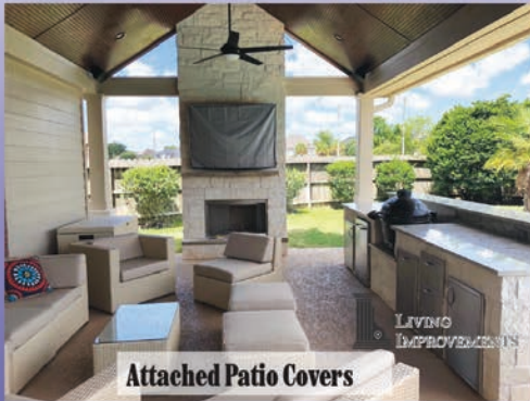
Attached Patio Covers

Award winning remodeling company that has been improving and upgrading homes since 1976.